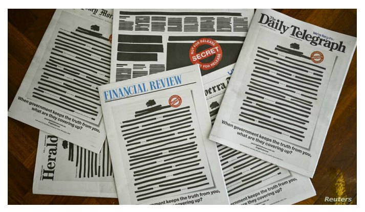
https://www.voanews.com/press-freedom/ aussie-papers-launch-front-page-censorship-protest - 34